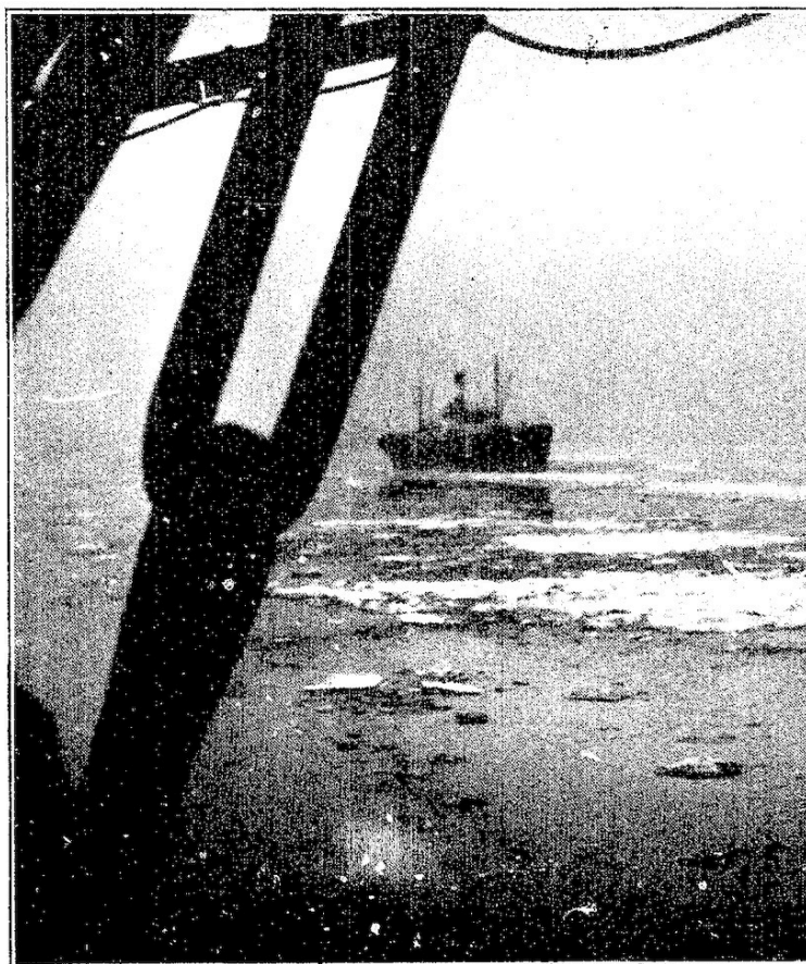
ICE ON THE MERSEY, JANUARY, 1940.